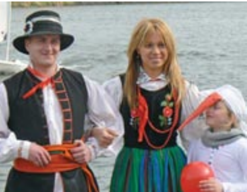
With thanks to Newry & Mourne Council