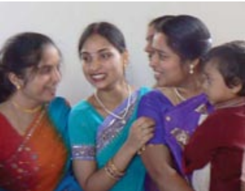
With thanks to Newry & Mourne Council