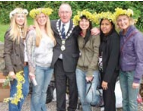
With thanks to Newry & Mourne Council